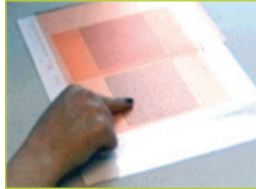
Comparison of two different coloured overlays

A coloured overlay assessment determines the optimal colour to use over a page of text to alleviate symptoms of visual stress. Many different colours are compared and a simple test is used to determine whether the chosen coloured overlay affects reading fluency. The chosen overlay can then be taken away and used for reading. Coloured overlays are, however, not suitable for written work or for reading words on white boards or computer screens. If the coloured overlays are found to be beneficial for reading, then coloured spectacles may be considered which are much more convenient for writing, computing and board work.