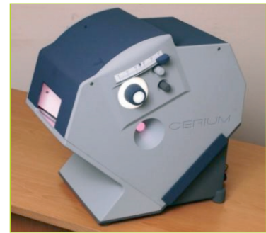
The Intuitive Colorimeter

The optimum colour for Precision Tinted Lenses is determined by a machine called an Intuitive Colorimeter. This machine was developed by Professor Arnold Wilkins of the University of Essex together with the Medical Research Council. The Intuitive Colorimeter systematically measures the 3 different parameters of colour; hue, saturation and brightness. By independently changing each parameter, the precise tint required to alleviate visual stress is determined. The exact details of the tint are then sent to a specialist laboratory to produce the Precision Tinted Lenses which can be incorporated into a normal spectacle frame. It is then advisable to have an annual colorimetry check as a change in the optimal colour can occur over time.